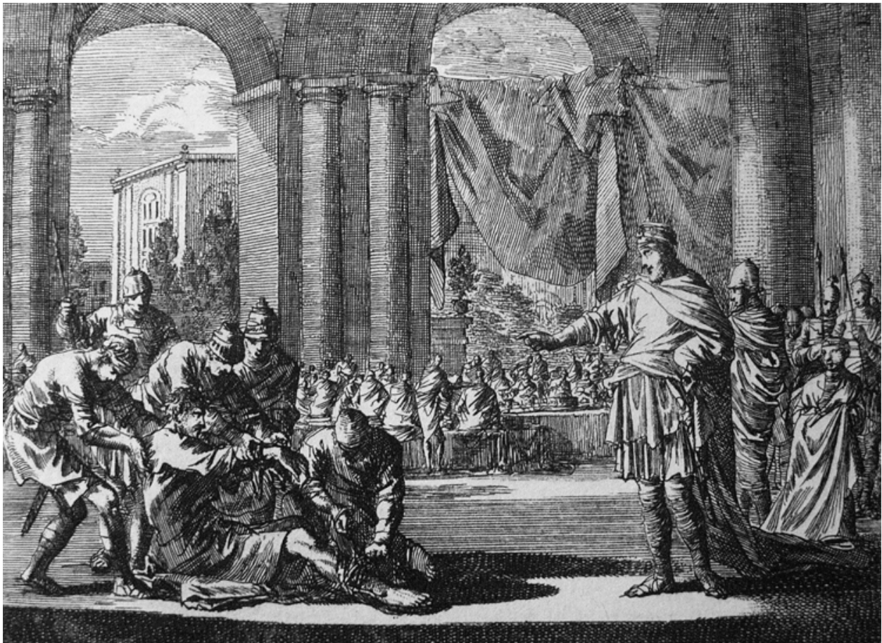
THE MAN WITHOUT A WEDDING GARMENT. MATTHEW 22:11-14. JAN LUYKEN

Please remember St Michael’s in your prayers and we hope you will return to worship with us again!