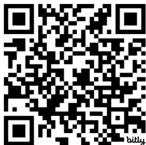
St. Michael's website

Online Giving: make your secure, private donation by scanning one of these QR codes.